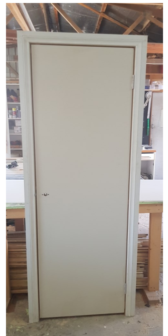
TRU-JAMB with DOOR